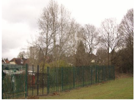
Above is the fence extension in progress and in place