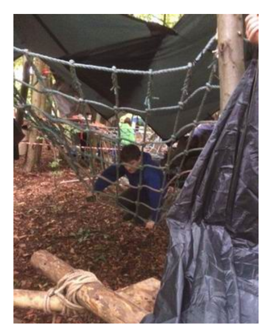
Explorers on their Tube marathon and at last year's Sky Camp