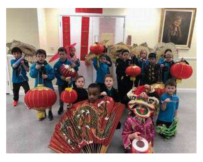
Here we see the Beavers enjoying Chinese New Year, a spooky night hike and an omelette (!) cooked in a bag