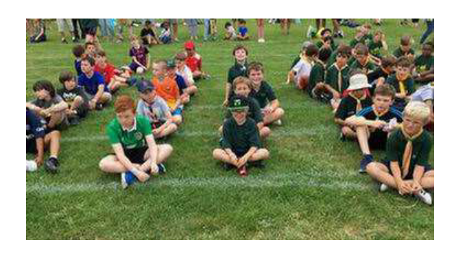
Above we see the 1<sup>st</sup> Northwood team at the District Cubs Sports Day. Below left the Cubs are ay Ruislip Lido and below right they are climbing at PACCAR.