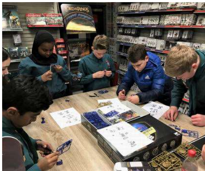
Above we see the Scouts making models