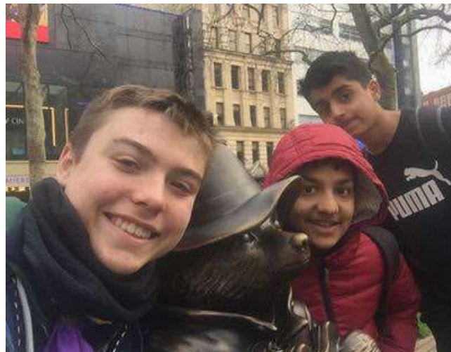
Explorers tackle a knotty problem and enjoy their Monopoly Run.